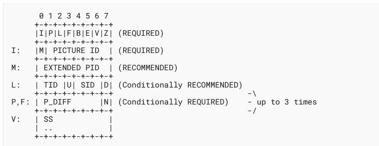
Figure 2: Flexible Mode Format for VP9 Payload Descriptor

In flexible mode (with the F bit below set to 1), the first octets after the RTP header are the VP9 payload descriptor, with the following structure.